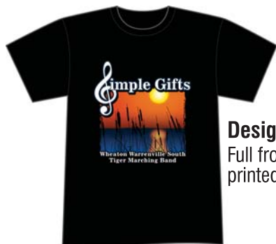
Design #1 Full front, screen printed Show logo

If purchasing 2XL size or larger please ADD price to item total