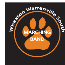
Design #3 Embroidered Paw Print design